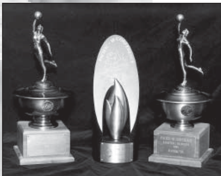
Washington has won three league championships since the Pac-10 started sponsorship of women's basketball in 1986-87. The Huskies took home the trophies for the 1987-88, 1989-90 and 2000-01 seasons.